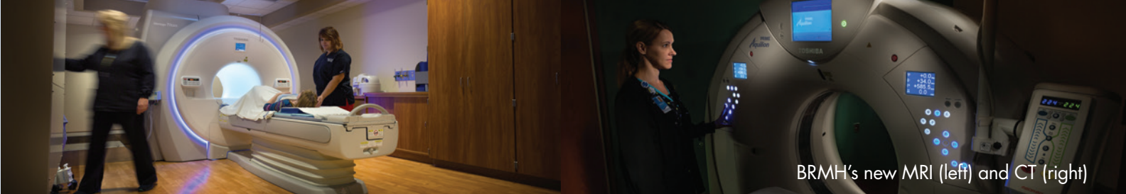
BRMH's new MRI (left) and CT (right)